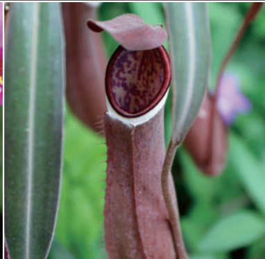
Nepenthes albomarginata Insectivorous plant native to Borneo, Sumatra and Malaysia.