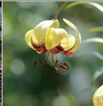
Lilium primulinum var.burmanicum Native to Myanmar to Thailand. Lilium nepalense has same flower, bigger than L.primulinum var.burmanicum .