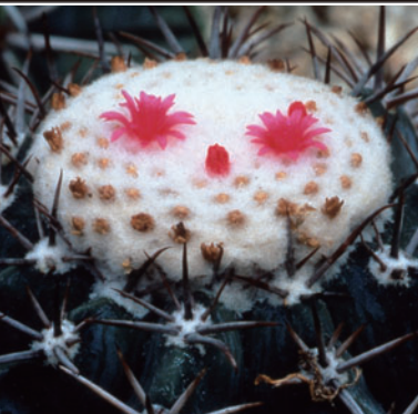
Melocactus A member of cacti and native plant in Mexico-Brazil. Flowers in April-May.