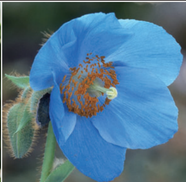
Meconopsis (Blue poppy and its relatives) Genus Meconopsis native to the Himalayas to Yunnan, Suchuan. and they have blue, purple,white, yellow and red flowers. Here Meconopsis can be seen almost all the year round by adjusting dormant period.