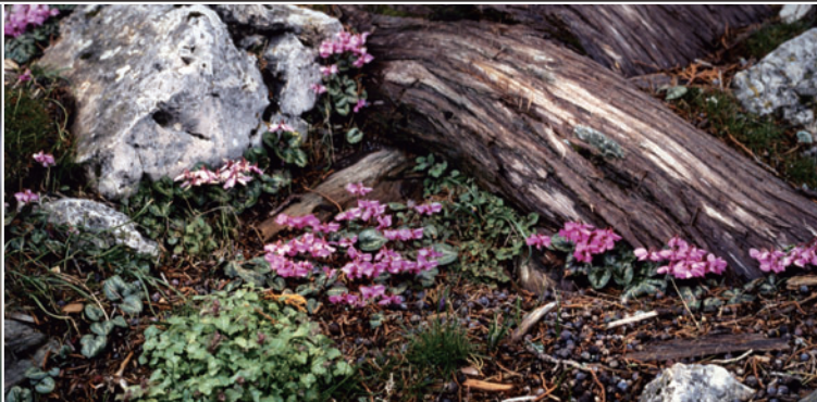
Cyclamen coum Genus Cyclamen includes about 20 species. C.coum is native to Turkey, hardy almost-20°C and blooms in Jan.-March. (photo taken in Turkey)