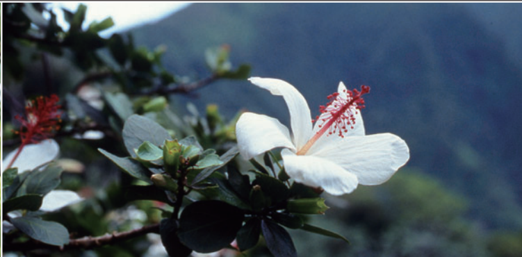
Hibiscus arnotianus The endemic Hibiscus in O'ahu in Hawaii, called "kokio keo keo" by the native people. 50 or more species and cultivars of Hibiscus are displayed all theyear round. (photo taken in O'ahu)