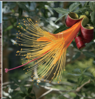
Adansonia rubrostipa (=A.fony) Endemic in Madagascar. It blooms around 19:00 at the beginning of Aug. and it takes about 30min to fully bloom from the bud.