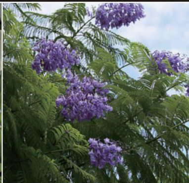
Jacaranda mimosifolia In the early summer lovely lavender flowers bloom and one of the most attractive trees in the outdoor landscape garden.

※Depending on the climate, situation of growth, etc., it is possible that flowers can not be enjoyed even during the flowering season.