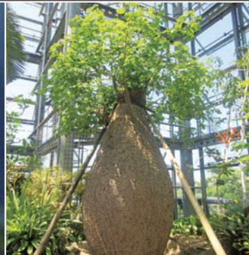
Ceiba (insignis?) Genus Ceiba is called "palo borracho" in Spanish. This huge tree, 500cm. across, was introduced from dry area in Argentina. Yellowish white flower blooms in autumn.