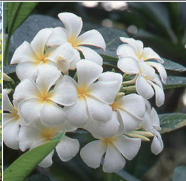
Plumeria Fragrant flowers bloom in July-Oct. very attractive tree for ornamental plant and for the lei in Hawaii.