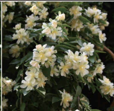
Pereskia aculeata This native plant in c. & s. America must be the ancestor of cacti. Fragrant flowers bloom in autumn.