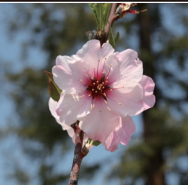
Amygdalus dulcis (almond) Native tree in w.Asia, blooms in spring, and has fruits in summer.