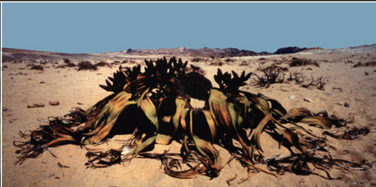
Welwitschia mirabilis Native plant in dry Namib Desert. Some of the native Welwitschia show the age over 2000 years, checked by carbon 14. Sakuya's Welwitschia mirabilis sown in 1960 is one of the biggest plants in the botanic gardens in the world. (photo taken in Namibia)