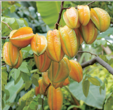
Averrhoa carambola "Star fruit" in English. nice to eat fresh and to bake pies.