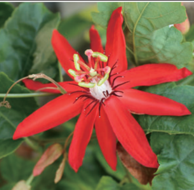
Passiflora coccinea This climber occurs in French Guiana. Hummingbirds, red flower lovers, are helpful for cross-pollination.