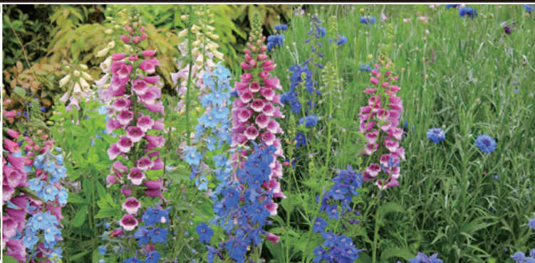
Delphinium, Digitalis In the petit English Garden about 100 kinds of perennials and annuals make color-schemed carpets of white, yellow, pink, blue and red flowers in group. April-Oct. is the best season for enjoying the mass of flowers.