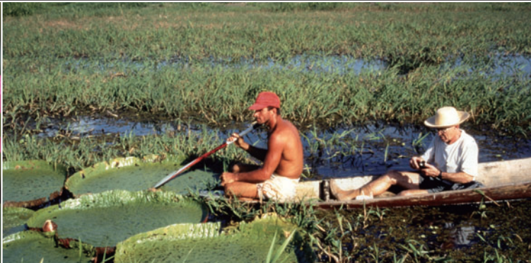
Victoria amazonica Native water plant in swampy areas in the Amazon. White fragrant flowers bloom in the evening, and next day the color changes into pink. (photo taken in the Amazon)