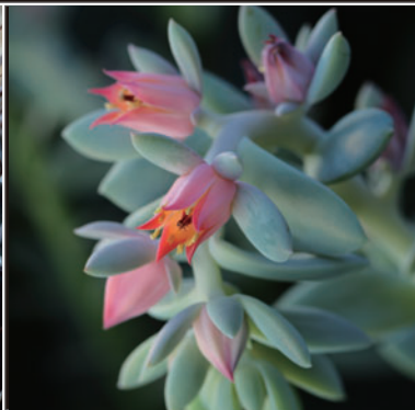
Echeveria Echeveria , a large genus of succulent plants, belongs to Crassulaceae. native to semi- desert areas of central America.