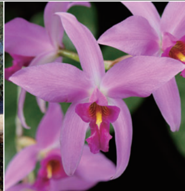
Laelia anceps Native orchid in Mexico. Flowers in Nov.-Feb. Relatives of Cattleya .