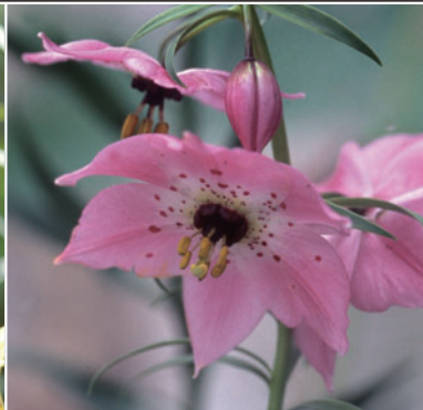
Nomocharis forrestii Bulbous plant in Yunnan and relative of Lilium .