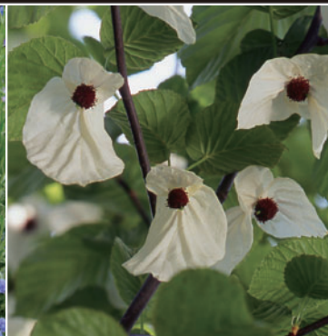
Davidia involucreta "Handkerchief tree" in English, An attractive plant native to Suchuan. At the end of April about 200 white leaf like spathe make a fantastic scenery.

※Depending on the climate, situation of growth, etc., it is possible that flowers can not be enjoyed even during the flowering season.