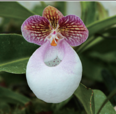
Paphiopedilum micranthum This lovely terrestrial orchid is found in southern China and North Vietnam. Flowers in March.