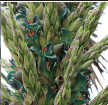
Puya alpestris Belongs to Bromeliaceae and native to Chilean Andes. Tall inflorescence contains many unusual teal green flowers in May-Jun.